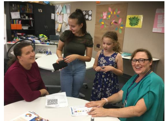
143 children took their families on a guided tour of the school.

Teachers valued the opportunity to meet new families and in some cases reacquaint themselves with familiar faces. Maintaining the communication between home and school is critical to your child's success – the next opportunity to formally discuss your child's progress is during Parent/Teacher interviews starting 23 rd of March 2020. However, if you have any queries before then, please don't hesitate to contact your child's teacher. The number of families that took part in the event was an increase on previous years but unfortunately this did not translate to a greater attendance at the Governing Council Annual General Meeting.